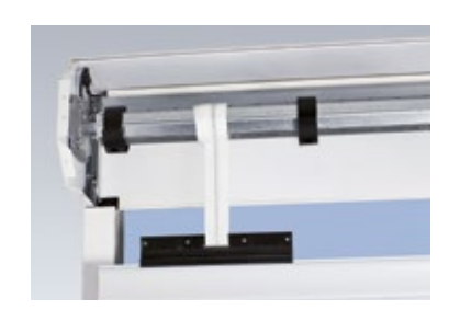
Easy to install The GaraRoll Lite features a handy-belt system for ease of fitting the curtain to the barrel.