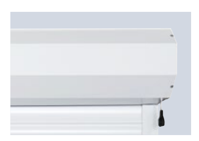
Cover supplied as standard All GaraRoll Lite doors are supplied with a cover for the curtain at the top of the garage door opening as standard, to meet European Safety Standards.