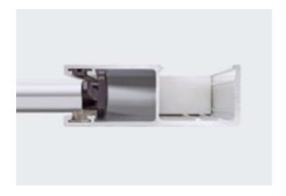
Reduced guide width to 72 mm With guides that are narrower than what is often found on a roller door, the GaraRoll Lite can be fitted within 75 mm reveals.