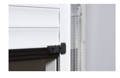
4 Spring assisted smoother, safer Our counterbalance springs complement the force limit of the operator, making an additional closing edge safety device unnecessary. The twin cables and spring-in-spring system also prevent the door from crashing down in the event of a cable or spring failure.