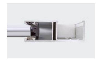
Wind locks for extra security The door comes with windlocks as standard to secure the door in the guide tracks and to enhance protection from unauthorised access.