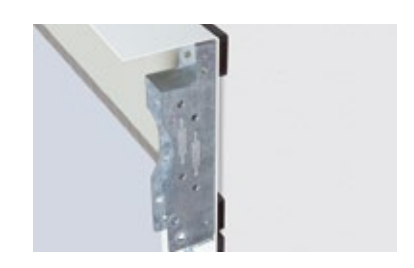
Fitting compensation set The fitting compensation kit is included as standard and ensures a flush-fitting installation of the door in uneven walls. For more information, consult the technical manual.